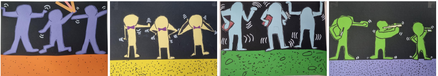
Some of our Keith Haring inspired production art

At the same time, our Year 5s will be developing their leadership and teamwork skills.