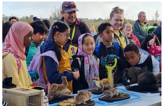
Learning about pests that threaten our environment