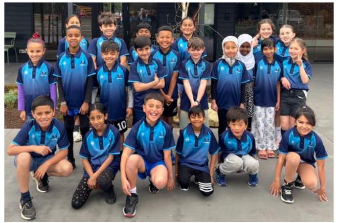
Tamariki who attended Inter-School Cross Country

Thank you to everyone who has already returned their uniforms. If your child still has a uniform at home please return them to the office.